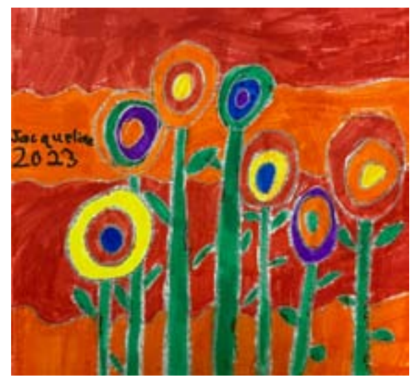
By Jacqueline Lombardo, Gr. 2

Students enrolling in pre-kindergarten, kindergarten, 3, 5, 7, 9, and 11 in a public school in NYS are required to present a dental health certificate; such dental health certificate must contain a report of a comprehensive dental examination performed on such child. A list of dentists who provide reduced cost examination is available in school health offices.