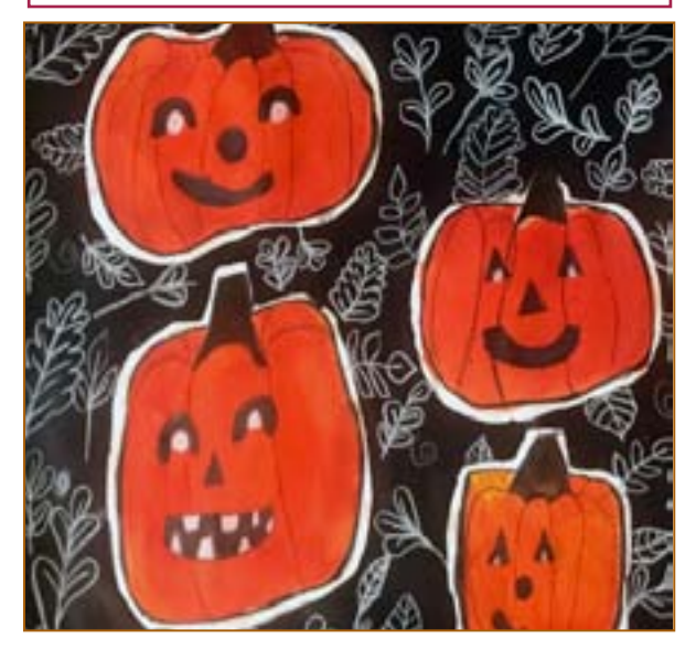
Abigail Sheppard, AJHS Gr. 8