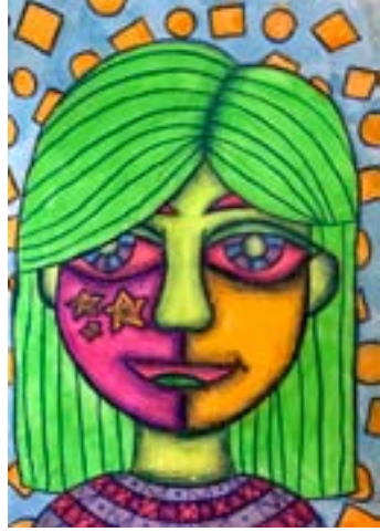
Meghan Farrel Gr. 8 AJHS