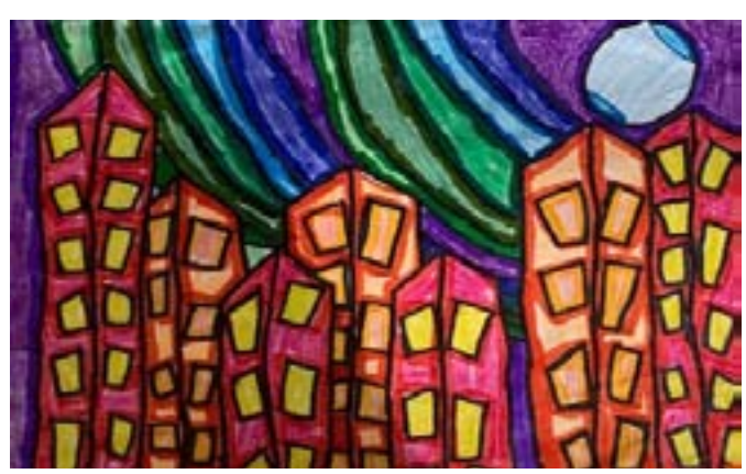
By Xavier Ray, Gr. 6 Owasco

Copies of the Code of Conduct are available in all school building libraries and main offices.