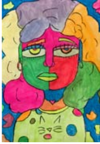
Casmyra Murray Gr. 8 AJHS

More info visit: aecsd.education/parentsquare