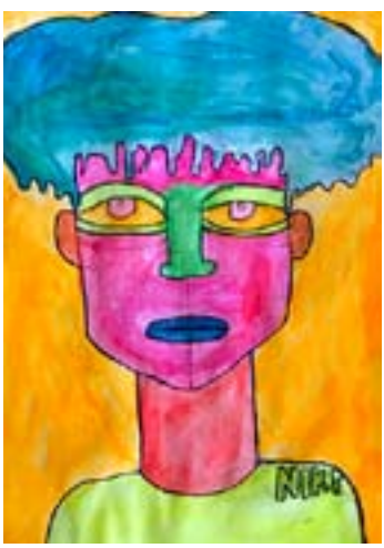
Jaylen Homick Gr. 8 AJHS