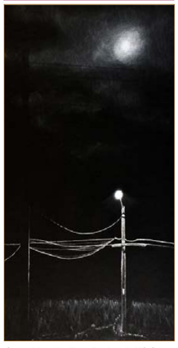
'Street Light' by Evan Bachta, AJHS Gr. 8 Gold National Scholastic Art Award

Check for the latest updates online: https://www.aecsd.education