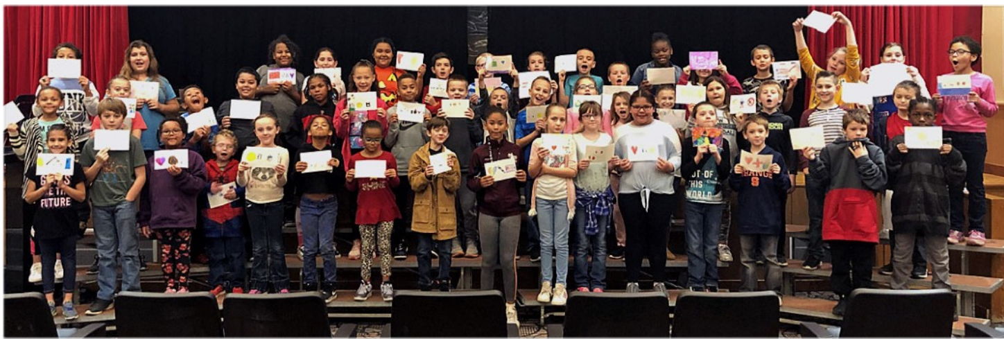
Genesee Elementary School 4th graders with their Wampum Belts

Through this partnership with HTCJP, the district intends to explore ways to apply a child-centered human dignity approach to its mission, curriculum, educational processes and recruitment efforts, building upon the AECSD's existing efforts in implementing New York State's Dignity for All Students Act (DASA). The workshop served as a starting point for further discussions of prospects and strategies for implementation.