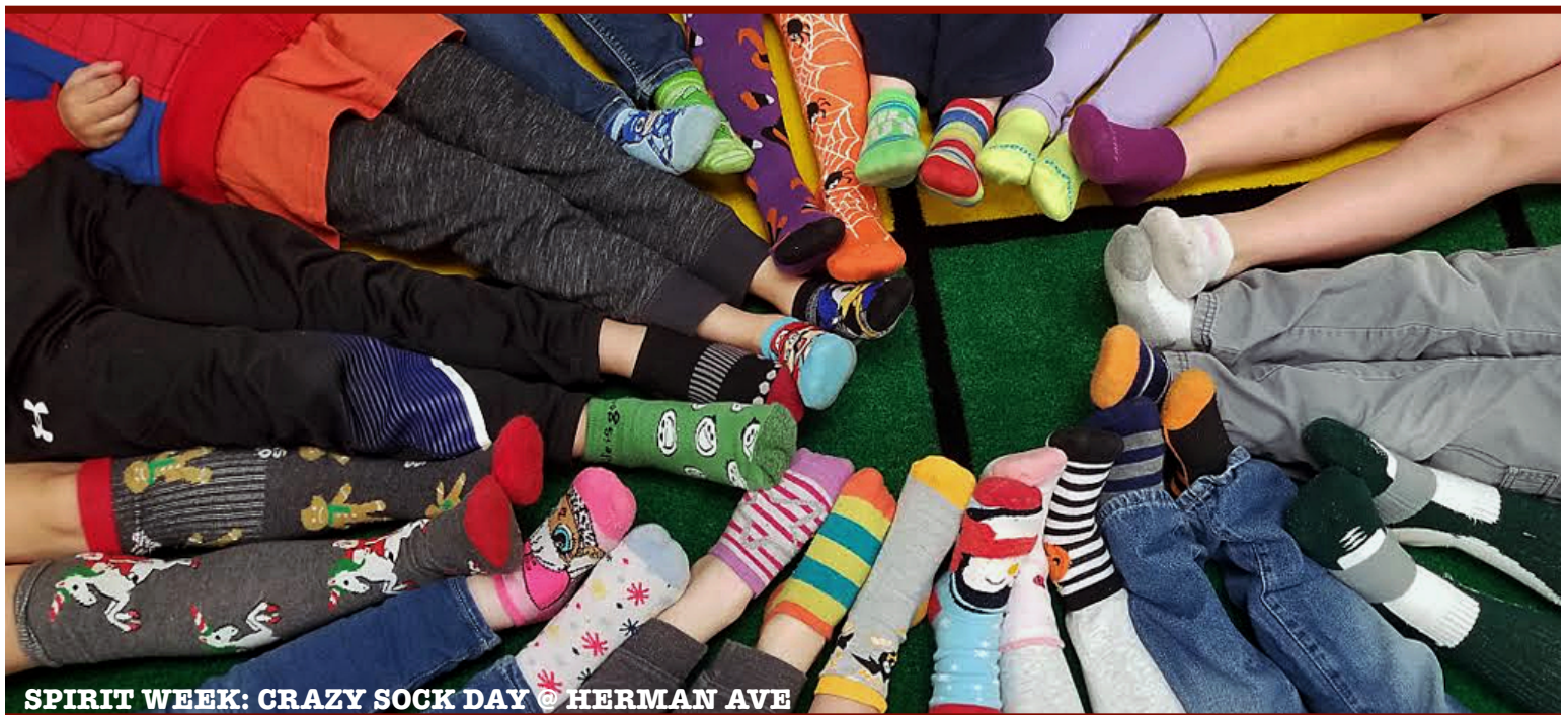
SPIRIT WEEK: CRAZY SOCK DAY @ HERMAN AVE