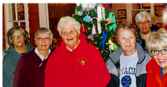
Auburn Grove residents and volunteers

The Village at Auburn Grove participated in the O'Hara Agricultural Museum's 2017 Festival of Trees by decorating a tree with 123 sets of hats, scarves, and mittens. Volunteers either made the items or raised money to purchase them. They have decided to donate all 123 sets to students in the Auburn school district.