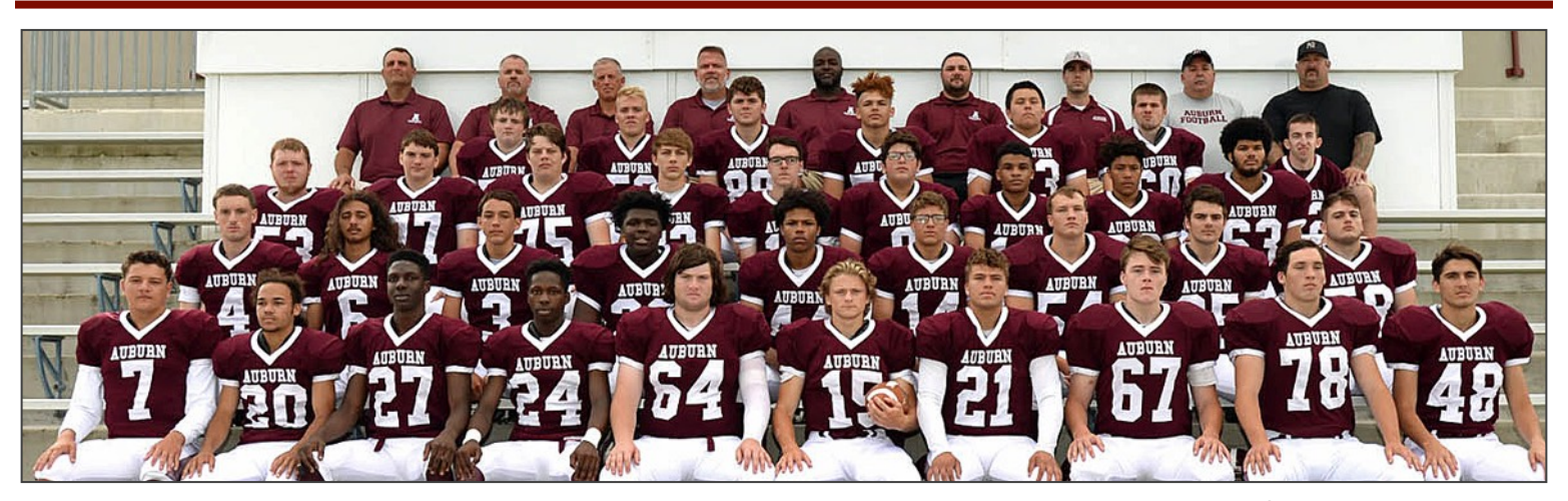
Congratulations to the Auburn High School Football Team - the highest scoring team in the history of the Auburn Football program, based on 9 games, with 344 points. The team was also the SCAC Team of the Month for November 2019.

Busses home are 9:30, 10:00, 10:30, 11:00, 11:30, 1:00, 2:00, 3:00 & 4:00.