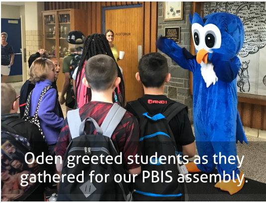
Oden greeted students as they gathered for our PBIS assembly.