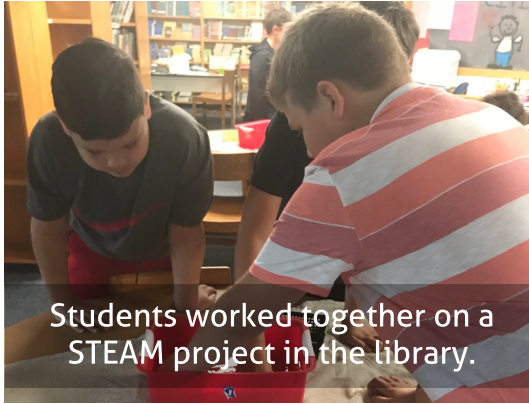
Students worked together on a STEAM project in the library.

The Owasco OPT recently purchased a merry-go-round for our playground, and our students love it!