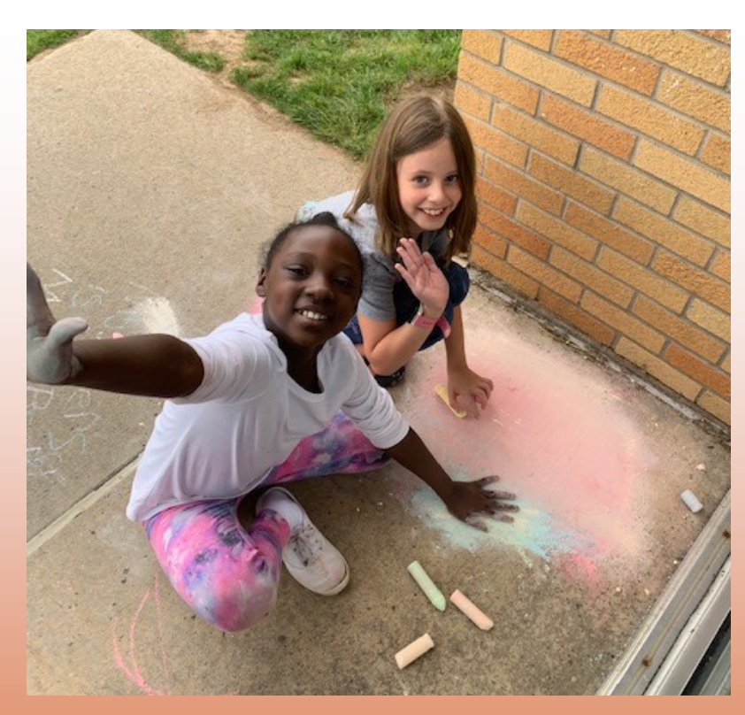
Let's get a little creative shall we?

6th grade volunteers loading the SPCA van with our donations!