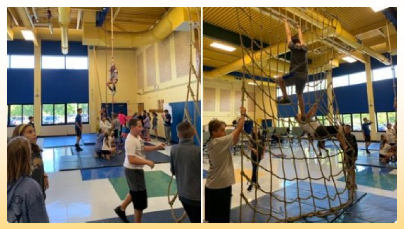
These may just as well have been cargo nets from the Black Pearl or vines from Tarzan's adventures in the jungles of Africa.