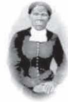
Harriet Tubman Administration Building