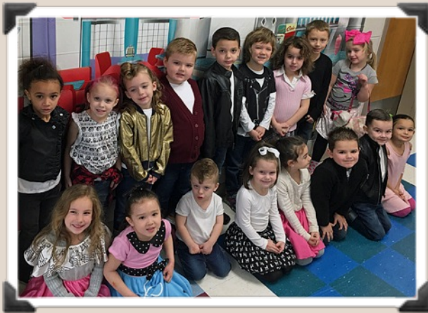
Casey Park Kindergarten Students