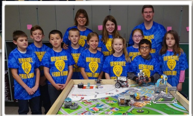
Right: Genesee Team