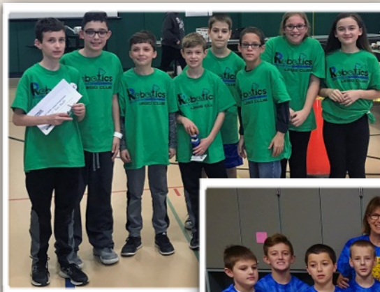
Left: Herman Avenue Team