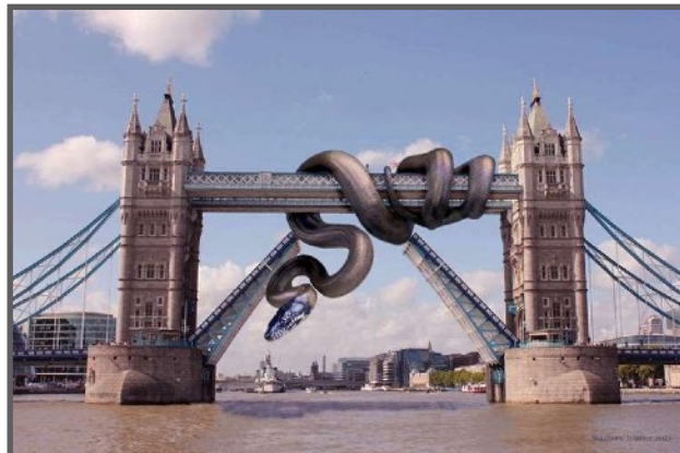
'Sight Seeing' Madison Wilbur - Honorable Mention