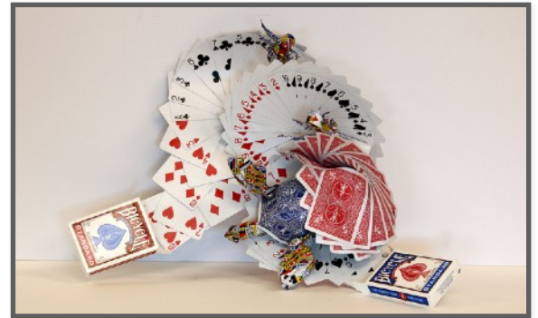
'Turtle Poker' Rachel Meyers - Honorable Mention