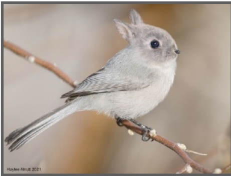
'In Waiting' Haylee Alnutt - Honorable Mention