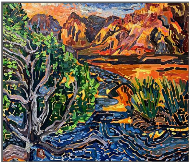
'Sunny Mountains' Bryn Whitman - Gold Key