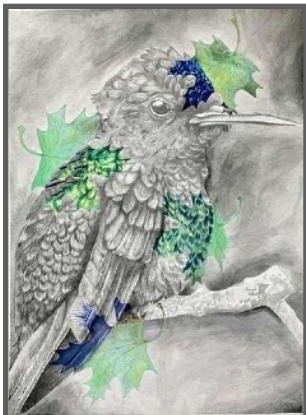
'Bird' Bryn Whitman - Honorable Mention