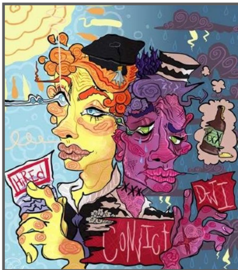
'Convicted' Bryn Whitman - Gold Key