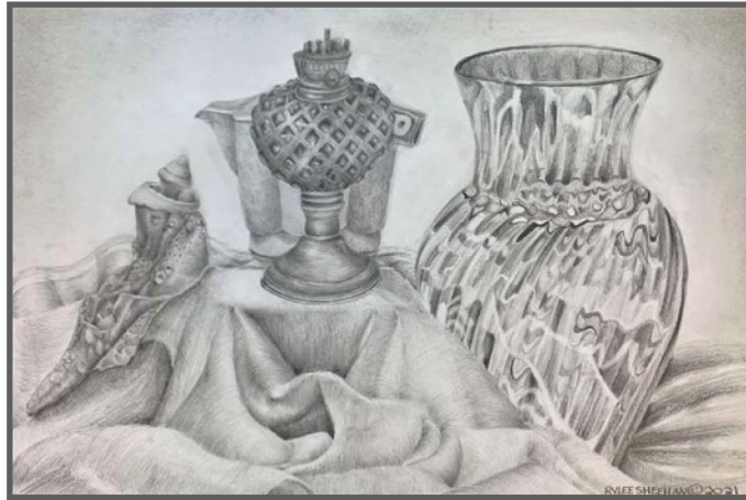
'Beams of Light' Rylee Sheehan - Silver Key