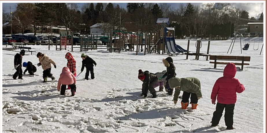
The kindergarteners at Seward embraced an outdoor math lesson, relishing the season's first snowfall while practicing shape drawing. Using rulers instead of pencils, students engaged in discussions about the sides and corners of various shapes, enhancing their understanding through tactile and visual exploration.