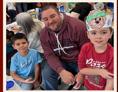
Kindergartners at Herman Ave had a blast making gingerbread houses with loved ones.