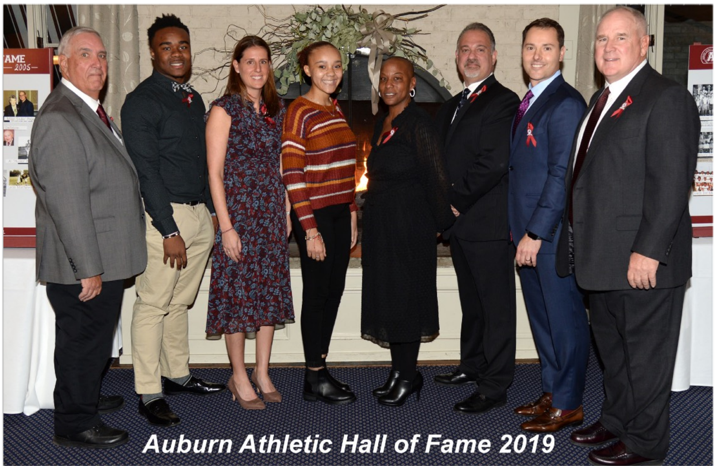
Auburn Athletic Hall of Fame 2019