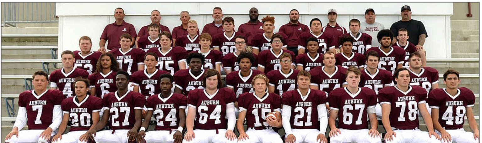
Congratulations to the Auburn High School Football Team - the highest scoring team in the history of the Auburn Football program, based on 9 games, with 344 points. The team was also the SCAC Team of the Month for November 2019.

Only students who have tests will report to their specific test on Tuesday, Wednesday and Thursday. Students who are not testing do not have to attend Tuesday, Wednesday or Thursday. School will be in regular session and all students will attend on Friday. All busses will run as normal in the morning to school. The bus schedule home will be modified on Tuesday, Wednesday and Thursday. Busses home are 9:30, 10:00, 10:30, 11:00, 11:30, 1:00, 2:00, 3:00 & 4:00.