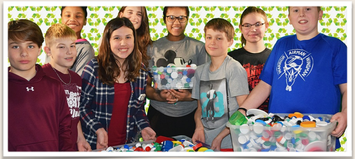
"Joshua's Buddy Benches" Project by the AJHS Environmental Club

Approximately 200 lbs of plastic bottle caps are needed to be melted down to be recycled into buddy benches. At this point the junior high school has collected over 37,000 bottle caps to be recycled. They reached their goal which is to provide a buddy bench for each of the elementary school buildings!