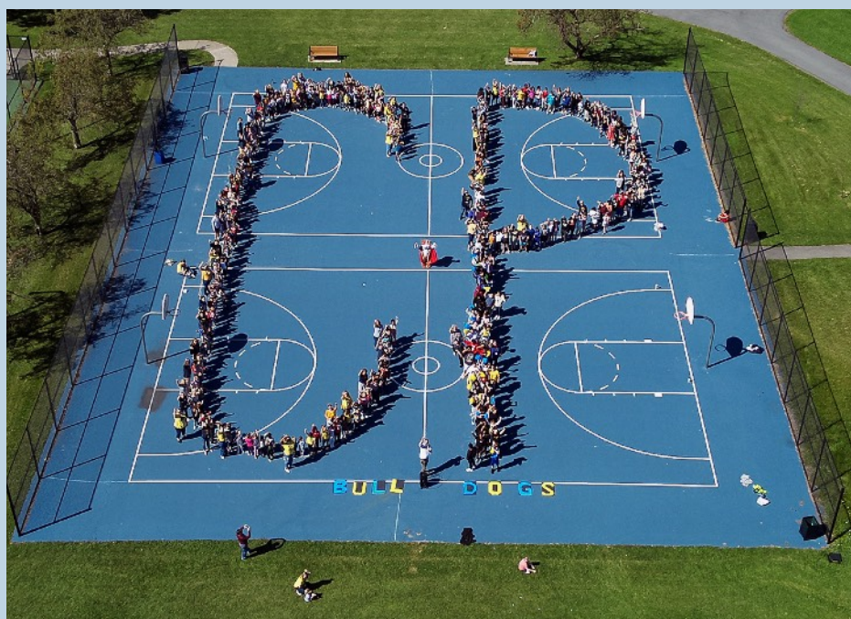
Students and Staff at Casey Park stood together with unity and pride to celebrate the first day of school!