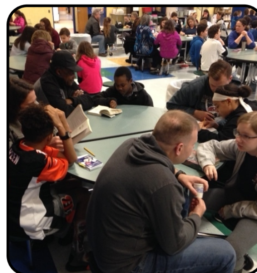
Above: Grade 5 Book & Breakfast