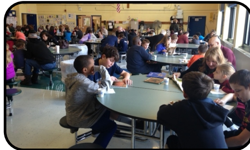
L: Grade 1 Book & Breakfast