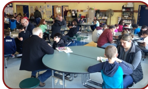
L: Grade 3 Book & Breakfast