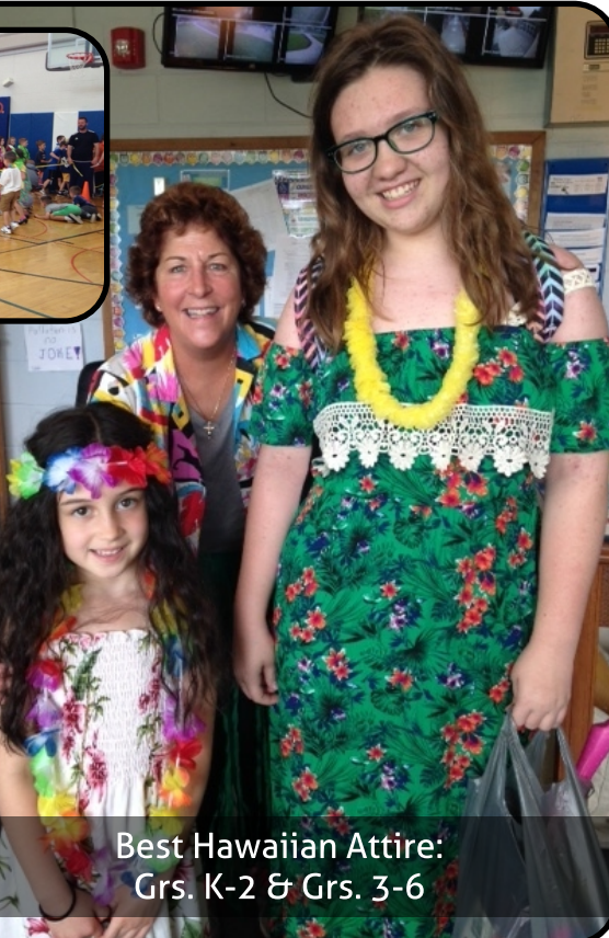
Best Hawaiian Attire: Grs. K-2 & Grs. 3-6